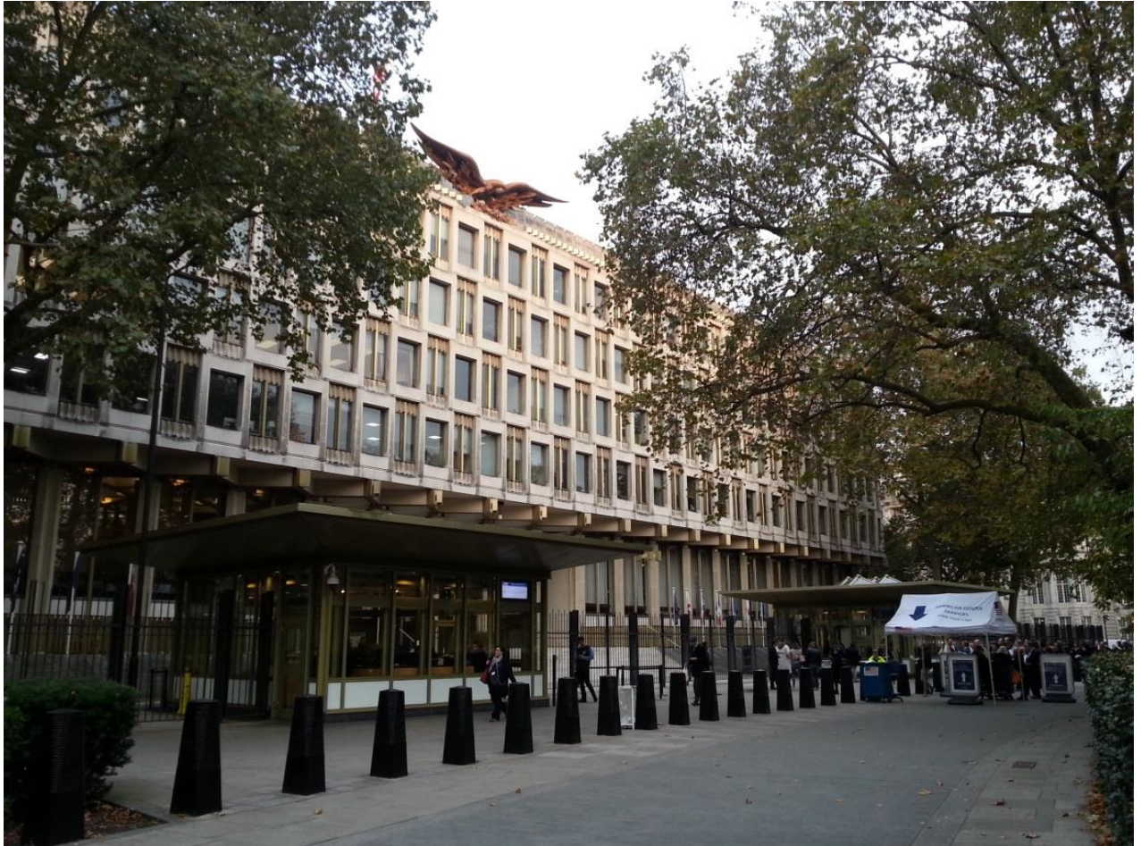
Front elevation (before redevelopment)